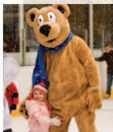
Fun with Snowplow Sam