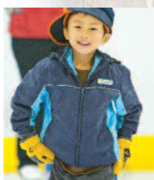
Having a Great Time