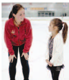
Fun, Knowledgeable Instructors