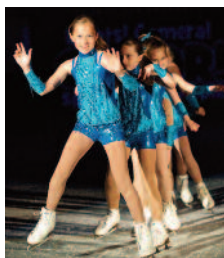
Lights! Camera! Color! Ice Show