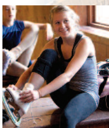
Friendship, Fun & Skating